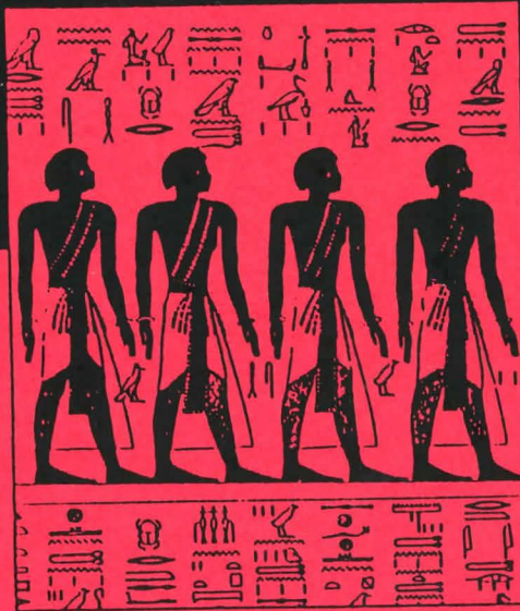
People of Kush from a wall painting in the tomb of Sen I around 1300 BC.

History has been written in the pages of the world's greatest biographies. But the best biographies are the ones that have been lost to history.