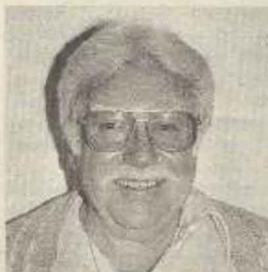
John B. Glennon