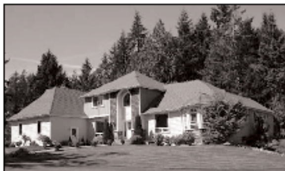
VIEW HOME IN WAUNA $775,000

The value of primary residences continues to rise on the Key Peninsula also. The median price of a three bedroom, two bath home is currently $288,000. Last year at the same time the same house was closer to $245,000. With regional rumors of the market turning to a buyer's market, these numbers show the Key Peninsula as an excellent market for sellers too!