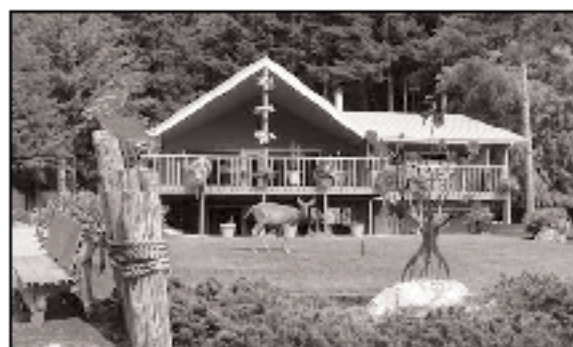
HERRON ISLAND VIEW HOME $545,000

These Dutch's Cove waterfront lots are nestled in the trees, will include a community water connection and an approved 3 bedroom septic design. Nice area where you can enjoy kayaking or scenic walks on the beach. Don't miss out on owning your very own salt water waterfront, call now! MLS 26147246, MLS 26147154, MLS 26147205, 26147278, 26147299