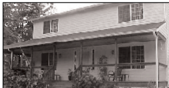
LAKE MINTERWOOD $349,000

You will enjoy the gorgeous view of Mt. Rainier, beautifully landscaped and terraced waterfall and green belt w/walking trails! Home features hardwood floors formal dining room, pass thru fireplace, master w/sitting room and fireplace, and much, much more. Don't miss out, call to see! MLS 26139271