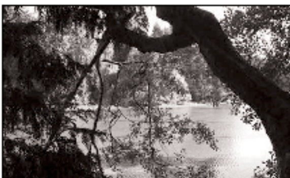
SEVERAL WATERFRONTS LOTS AVAILABLE

You will enjoy the community beach here at Lake Minterwood, where you can fish a lake stocked with trout, swim, canoe or enjoy using the park area. This charming country style, 2 story home, has a wrap around porch and is on 1.14 acres. You will enjoy the bay sitting areas in both kitchen & master suite and the separate dining area with oak floors. 2 car attached garage and the handyman in the family will love the separate 2 car detached garage with shop, storage and a gated area for your RV and boat MLS 26155645