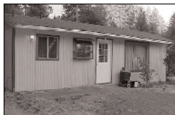
PALMER LAKE $219,000

Spectacular four plus acres, in a private, secluded, retreat like setting, with a peaceful pond and trees. Road already in. Perfect place to build your dream home. MLS 26146963