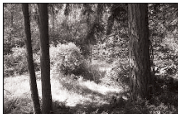
ON GOLDEN POND IN LAKEBAY! $162,500

Breathtaking views of the Olympic Mts. and the Sound from the deck. Home has been completely remodeled throughout w/new cabinets, granite counter tops and window sills, new stainless appliances; the vaulted ceilings and large brick/stone fireplace creating spaciousness throughout. Perfect place for large gatherings, retreats or shared vacations. MLS 26020772