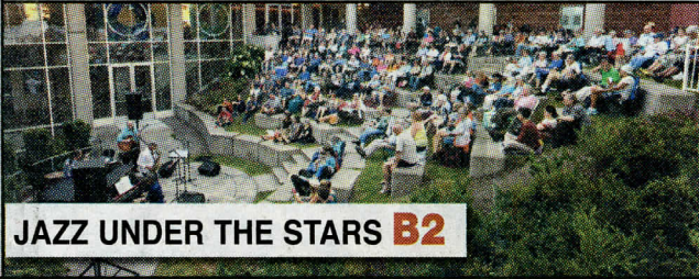
JAZZ UNDER THE STARS B2