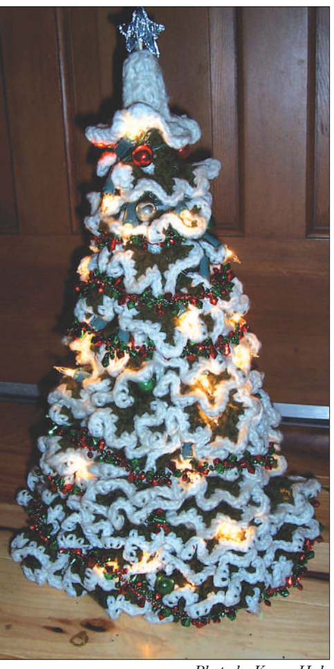
A crocheted tree makes a pretty gift. Directions online at www.keypennews.com.