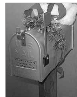
Santa's mailbox at the Vaughn Post Office.

One of Santa's helpers said the letters were very precious to him. He takes them home to the North Pole to read in the evening, when the toy workshop is closed and quiet. Mrs. Claus makes hot chocolate, and Santa sits in his comfortable chair by the fireplace. One by one, he takes letters from the stack on the table by him and reads them completely. He pens good cheer and warm wishes on special stationery to each person who