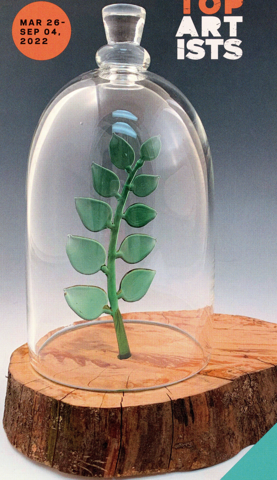
Ellye Sevier, Preserve (detail), 2019. Frameworked glass, and wood, 9 × 8 × 4 1/2 in. (22.9 × 20.3 × 11.4 cm).