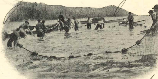
SALMON FISHING ON THE COLUMBIA

to Mt. Vesuvius at this time, and the Catskills - I don't think I have been very lousome yet - but it is awful - by quick. Mary goes out in the evening and I really don't feel afraid - I light